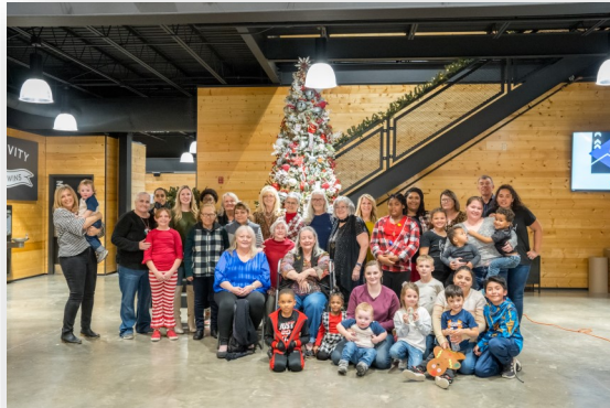
Diamond C has done it again!