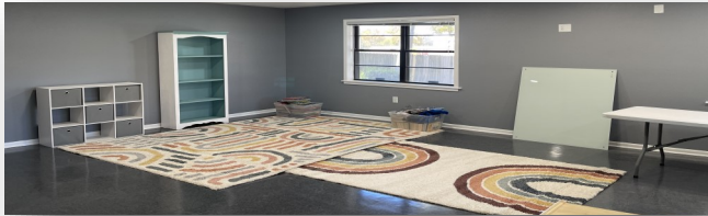
Children's Activity Center